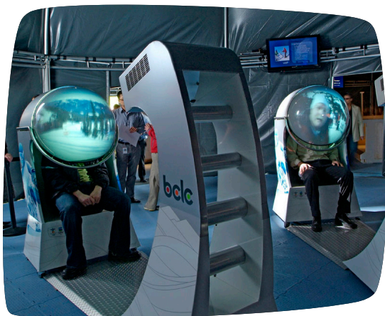
Bobsleigh simulator, BCLC 2010 Winter Games Dome

Step into the shoes of an Olympic athlete, through interactive and virtual experiences offered in the BCLC 2010 Winter Games Dome.